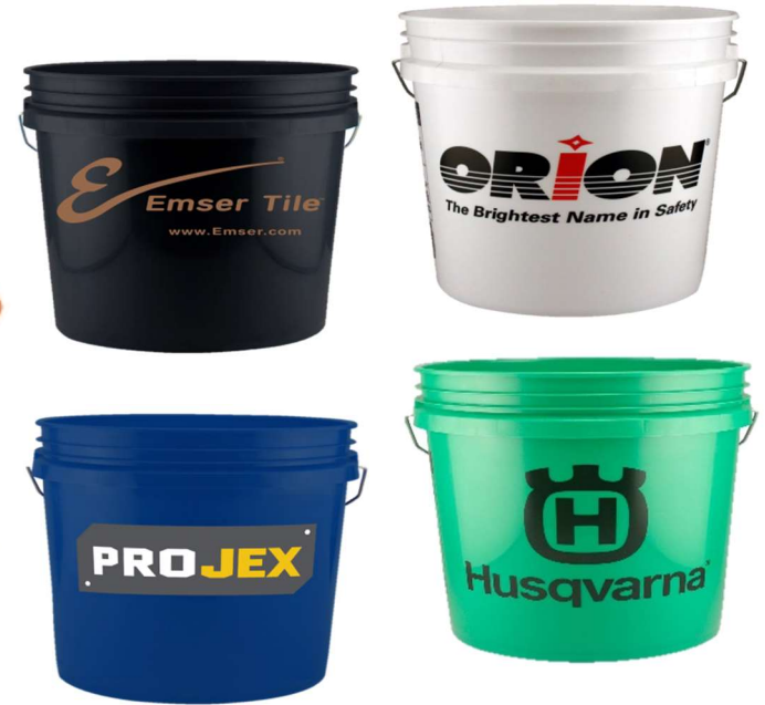
Custom 3.5GL Bucket Representation

Leaktite's customers have the option to manufacture 3.5-gallon buckets in custom colors for an upcharge. All requested colors will require a specific PMS color or an object representing the desired color, sent to Leaktite, for part matching and pricing.