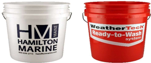
Custom 3GL Bucket Representation